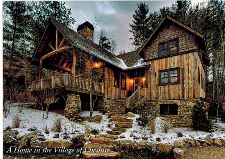
A Home in the Village of Cheshire

A scenic 15 mile drive to the east of Asheville, just off of I-40, Black Mountain nestles in the Swannanoa Valley. To understand the lure of living in this charming mountain community, consider that The Reverend Billy Graham chose to live right next door in Montreat and build his legendary evangelical training and retreat center, The Cove.