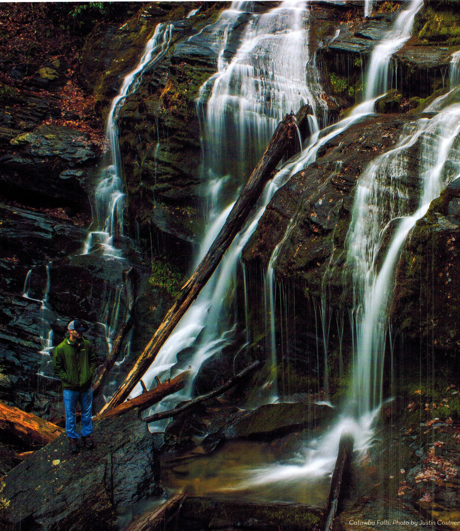
Catawba Falls