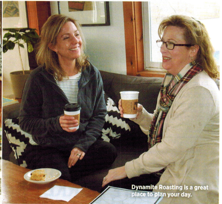
Dynamite Roasting is a great place to plan your day.

Competing with the wonderful smells of fresh mountain air and blooming flowers in the Swannanoa Valley is the enticing smell of coffee. The Valley boasts some of the finest freshly roasted brews that you'll find anywhere. Select your vibe and velocity, and you'll find it here at one of our coffee shops and gathering spots.