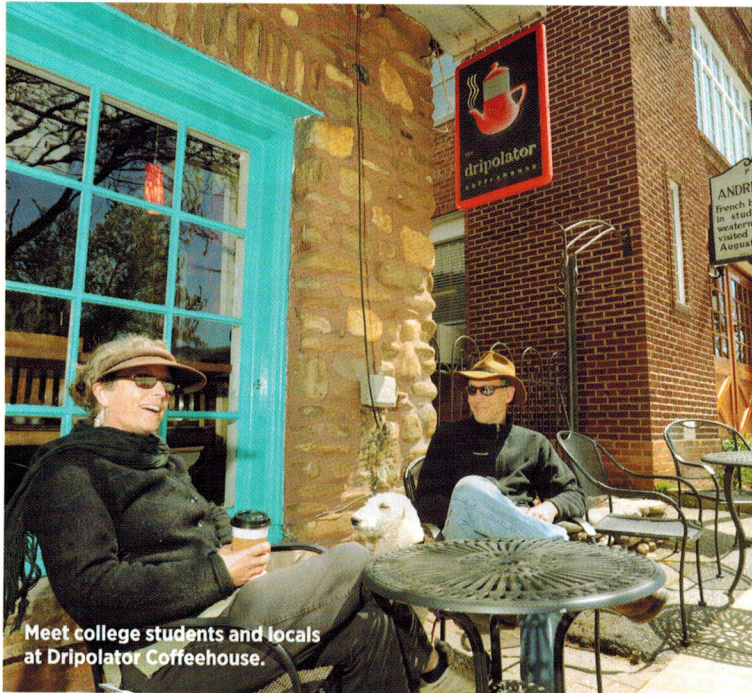
Meet college students and locals at Dripolator Coffeehouse.